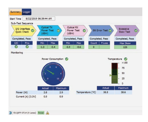
Figure 3. Results Summary page

Once the configuration has been completed, the user can start the test, which will bring up the Summary page containing the key results and verdicts associated with each phase in the test sequence, as well as monitoring tasks related to each phase. A progress status is provided for each test. It is worth noting that several tests are executed quite quickly.